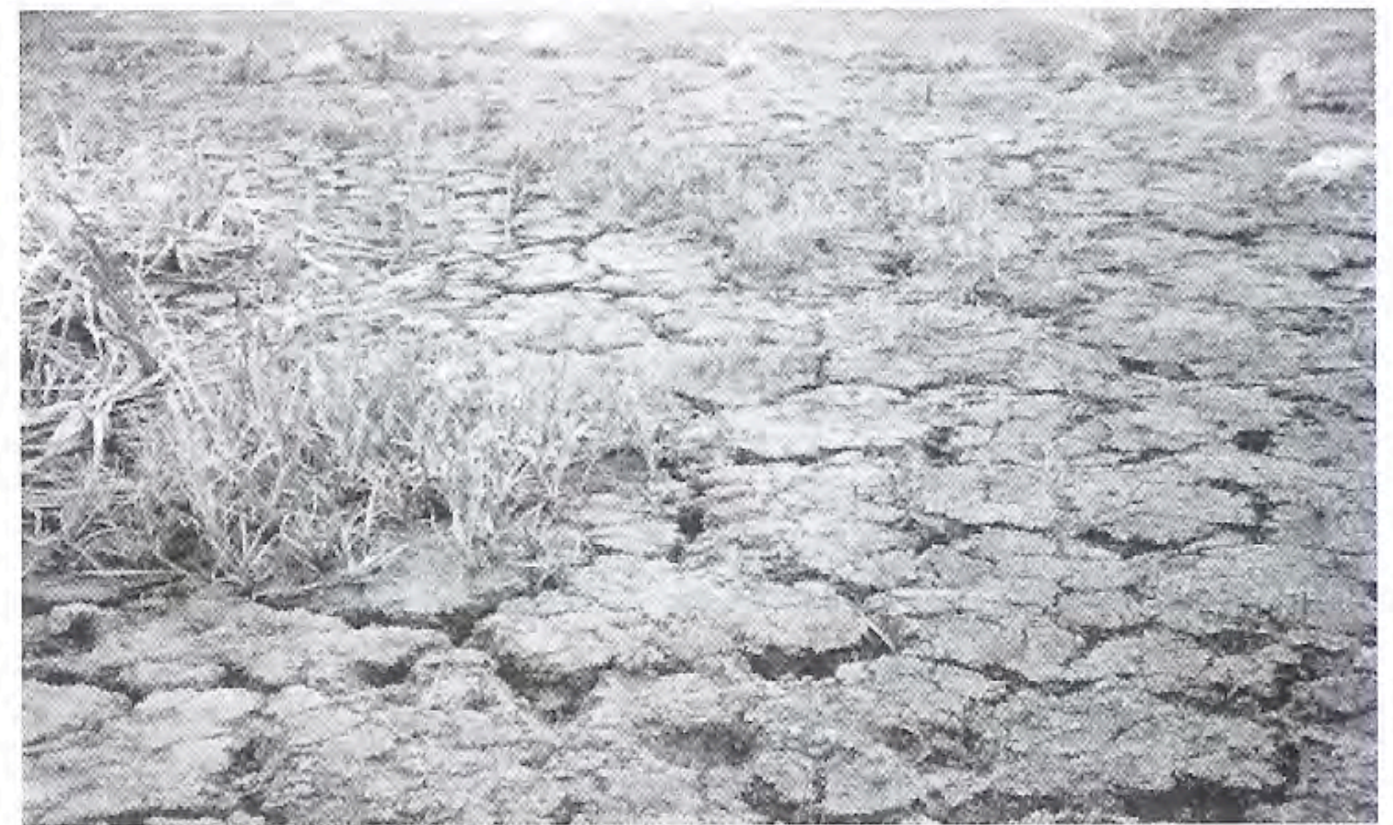
FIG. 1. Desiccation cracks in a (dry) pond bottom in which California red-legged frogs were observed utilizing as refugia in east Contra Costa County California.

Stock ponds, where this species might occur, are often dredged to remove built-up silt loads (pers. obs.). Typically, dredging oc-