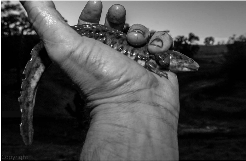
FIG. 2—Premetamorphic California tiger salamander ( Ambystoma californiense ) larva from Eagle Lake, Santa Clara County, California (see Wilcox et al. [2015] for genetic evaluation of this specimen). We released the specimen (122 mm snout–vent length, 242 mm total length) immediately after we recorded measurements.

conditions, such as perennial water bodies created for cattle, may drive or support facultative pedomorphosis. It may not be surprising, therefore, that the largest reported size to date of a California tiger salamander before metamorphosis is that of a specimen (122 mm SVL; 241 mm TL) collected from a perennial pond (Wilcox et al., 2015). We predict that as these anthropogenic ponds are further investigated, the maximum reported threshold will increase.