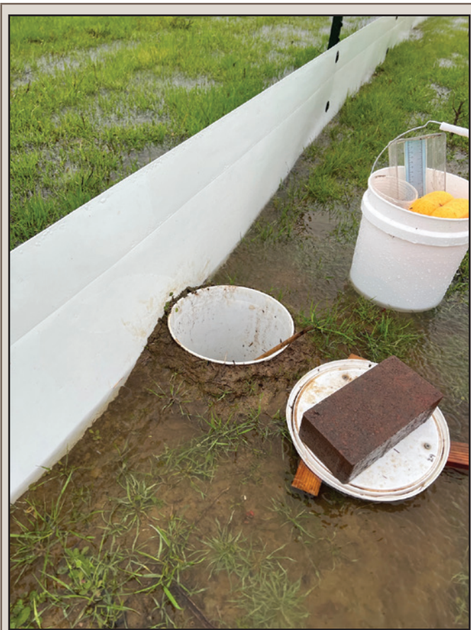
FIG. 2. Pitfall trap raised above flooding level using soil mound.

Azizi and Landberg 2002. J. Exp. Biol. 205:841–849). This may be confounded by lower temperatures and recent developmental metabolic demands associated with metamorphosis, that likely slow or limit the ability of salamanders to move effectively (Landberg and Azizi 2010, op. cit. ; Stebbins and McGinnis 2012, op. cit. ).