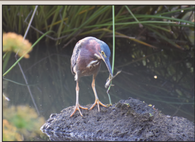
FIG. 1. Adult Butorides virescens grasping the hind leg of a post-metamorphic Lithobates berlandieri in Veracruz, Mexico.