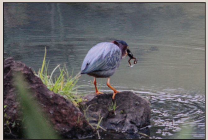
FIG. 3. Adult Butorides virescens grasping a post-metamorphic Lithobates berlandieri in Veracruz, Mexico.

Texas J. Sci. 27:244–245; www.amphibiaweb.org/species/4990 , 28 Jul 2023). Here, we document three predation events, one on a tadpole and two on post-metamorphic L. berlandieri by Butorides virescens (Green Heron). The diet of B. virescens includes small fish, a diversity of invertebrates, and L. catesbeianus (American Bullfrog) tadpoles (Helm 2012. Northwest. Nat. 93:85–87).